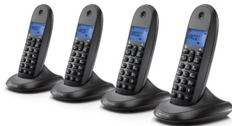
Quad Pack C1004LB+