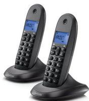
Twin Pack C1002LB+