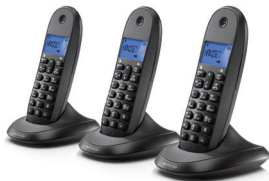
Triple Pack C1003LB+